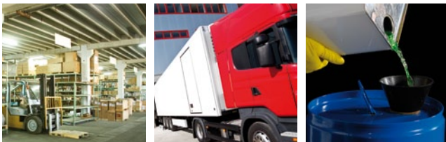
* The B-EX4T2 was benchmarked against competitor products in stand-by mode.

The B-EX4T2 is available in either 203/300 or 600dpi variants, allowing for specialist high resolution printing with superior print quality.